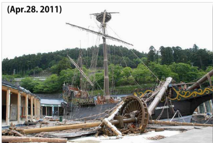
Hasekura Rokuemon Tsunenaga